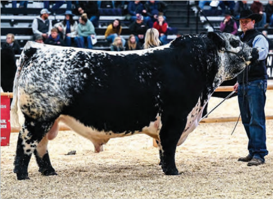
NOTTA 305E PRIME TIME 312H