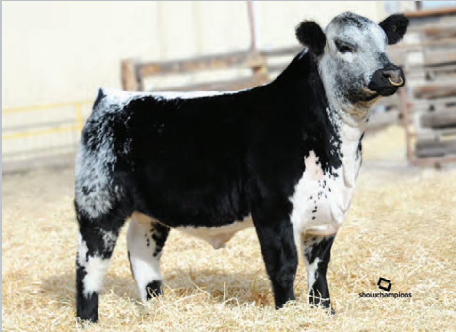
SIX STAR 82U ROYAL FLESH 101Y