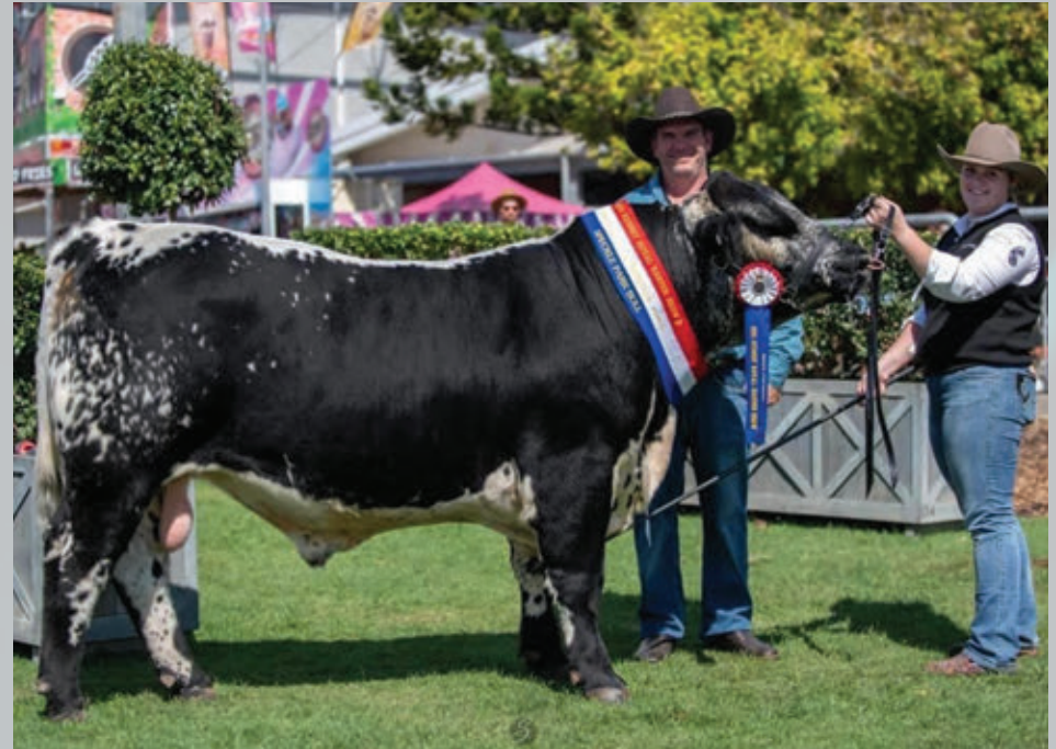
FULL SIB - CHAMPION BULL SYDNEY ROYAL 2021