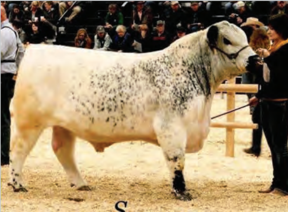
OUTBACK JOEY 25D