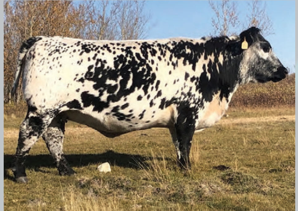
NOTTA 110B THETA 203E